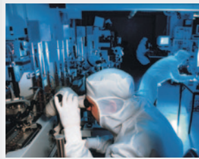
Research and development laboratories