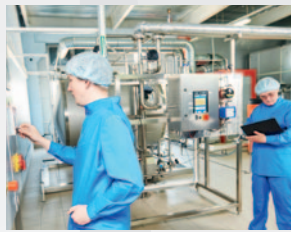
Secure production zones